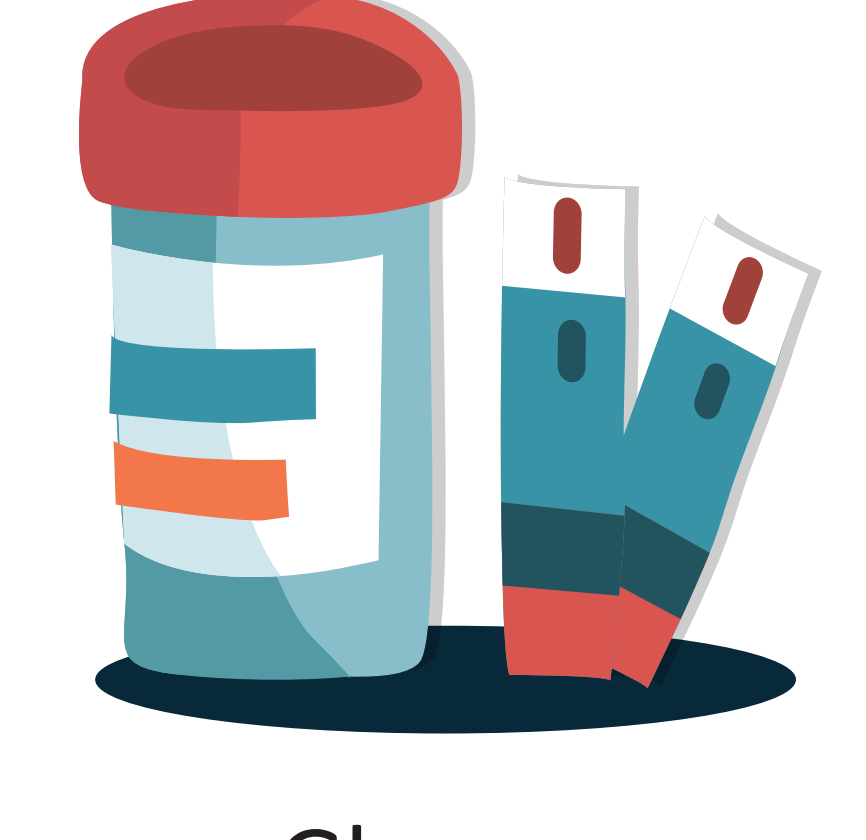
Glucose Glucometer Test Strips