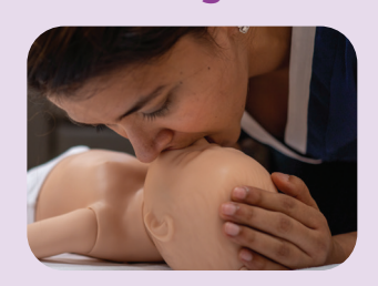
Give 5 rescue breaths until the chest rises.