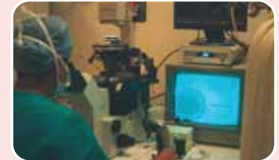
Fig. 3: An embryologist performing an ICSI (injection of a single sperm into the cytoplasm of the egg) in the IVF lab.

Intracytoplasmic Sperm Injection or ICSI is used to aid fertilisation for men who have low sperm count. It is also an option for men with congenital absence of the vas deferens or for those who had vasectomies. ICSI is also offered to couples who previously had poor fertilisation or total fertilisation failure with IVF. Following oocyte retrieval, a single sperm is injected into each oocyte. The resulting embryos are cultured for three to five days before being transferred into the uterus of the patient.