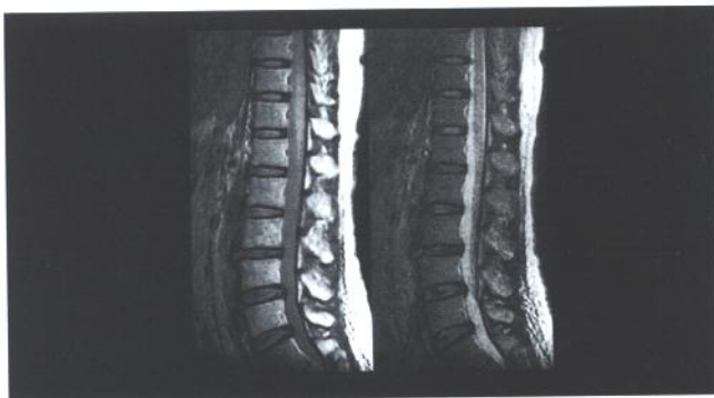
MRI image of the spine