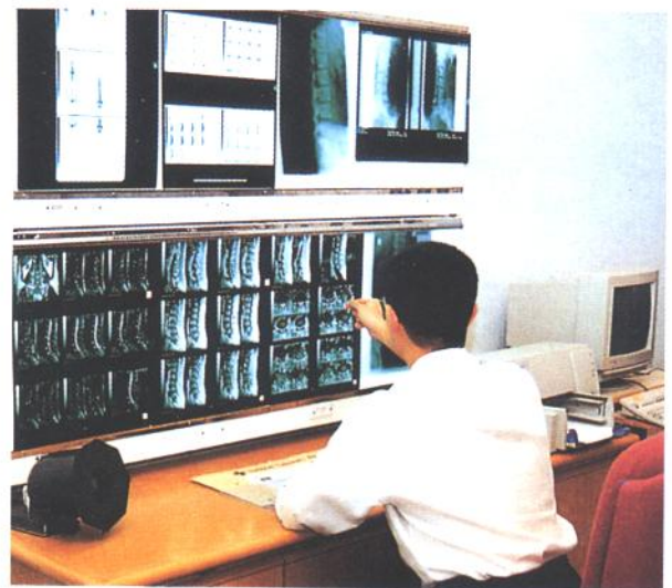
Radiologist reviewing the images

These studies require scheduling and missed appointments may result in your doctor being unable to collate his findings. If you arrive late, it may result in a re-scheduling of your appointments.